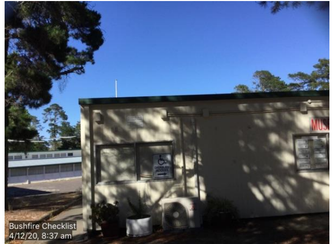
Taken : 04/12/2020