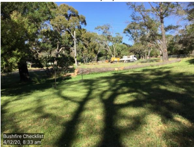
Taken : 04/12/2020