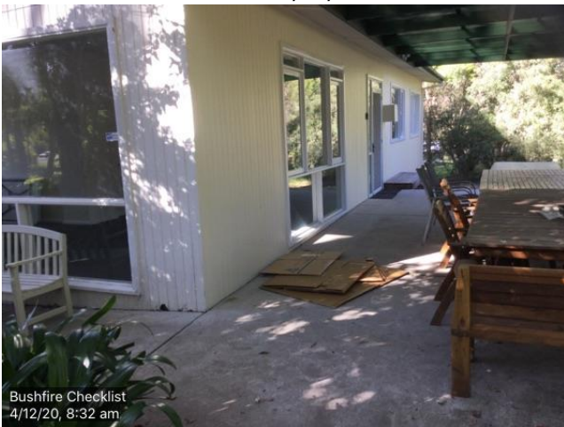
Taken : 04/12/2020