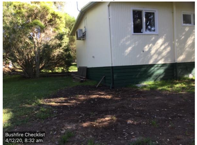
Taken : 04/12/2020