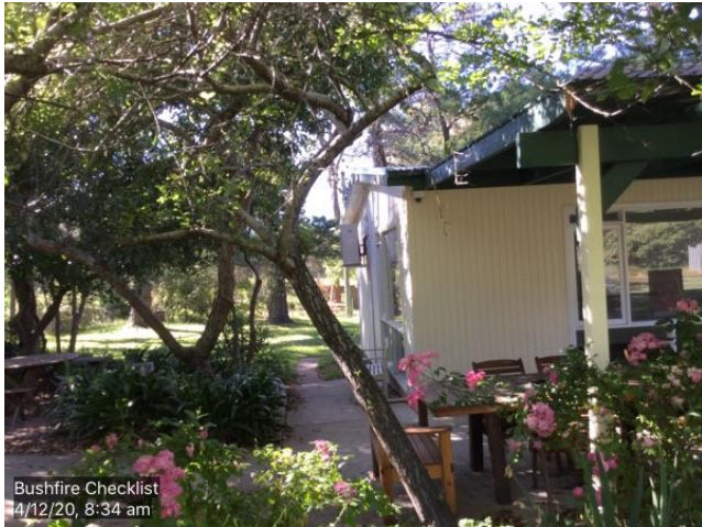
Taken : 04/12/2020