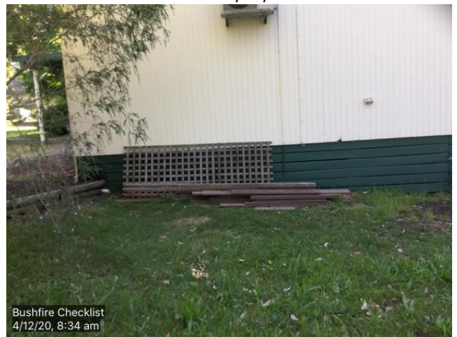
Taken : 04/12/2020