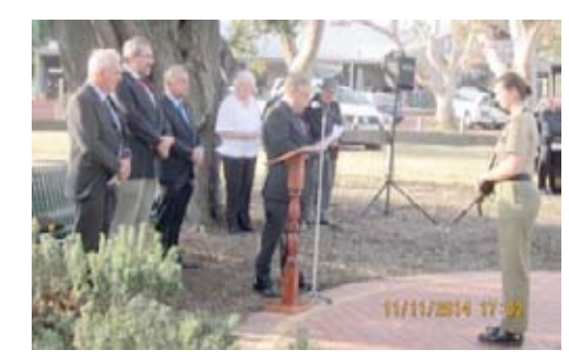
On 11 November, we gathered at the War Memorial to remember those who died or suffered in all wars and armed conflicts. Lest we forget.