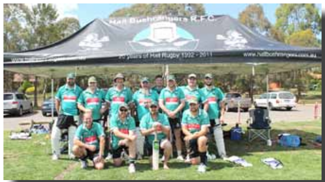
Cricket team prior to their first final

The Good Sports program is supported by ACT Health and the Australian National Preventive Health Agency.