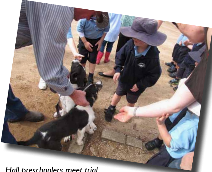
Hall preschoolers meet trial puppies Stomper and Jazz. They are also preschoolers and one day may be champion trial dogs.