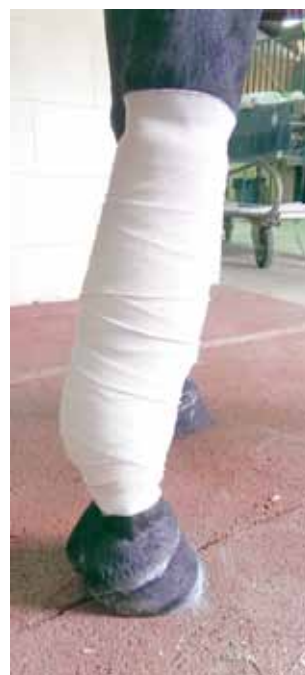
Final adhesive layer

Finally you cover the uncovered ends with an adhesive layer (Elastoplast) to keep everything in place. Start on the actual bandage and work to the skin, not the other way round. This prevents shavings or dirt entering between the skin and bandage. Often we cover the entire bandage with Elastoplast.