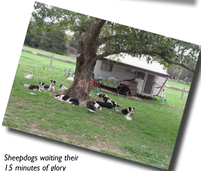
Sheepdogs waiting their 15 minutes of glory