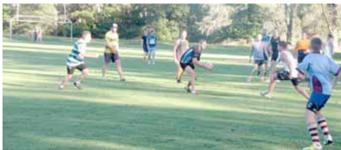
Hall Bushrangers Rugby prepare for the 2014 season.

'Twas the weeks before Rugby Season The Bushrangers been training, its been pleasin' The boots are relaced and the jumpers all clean The rain has been good and the grass is green.