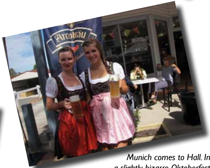
Munich comes to Hall. In a slightly bizarre Oktoberfest event in March, sheep dog trialers and locals were invited to taste German beer at Hall Premier Store during the week of dog trials at Hall.