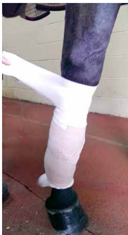
Fixation of the top end of the bandage to the skin; remember to start on the bandage

If you are not sure which materials to use for the bandage, don't hesitate to ask your vet for advice.