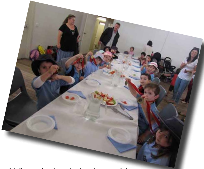
Hall preschoolers display their medals received for outstanding art works, which were on display during the National Sheepdog Trials.