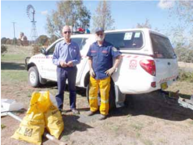
Once again a small but enthusiastic group of volunteers participated in Clean up Australia 2014, collecting rubbish from Wallaroo, Southwell, Brooklands, Oakey Creek, McCarthy, Gooromon Ponds Roads and Woodgrove Close.