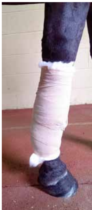
Third layer - the top and the bottom part stay uncovered

The third layer needs to be of a stiffer material to hold the previous layers in place and prevent sliding of the bandage on the wound. A slipping bandage disrupts the cells trying to heal across the wound. It is important to ensure there is even pressure in this layer and it also wraps from the outside of the leg inward. The bottom and the top end of the cotton are left uncovered to avoid creating pressure points. We generally use brown crepe gauze for this