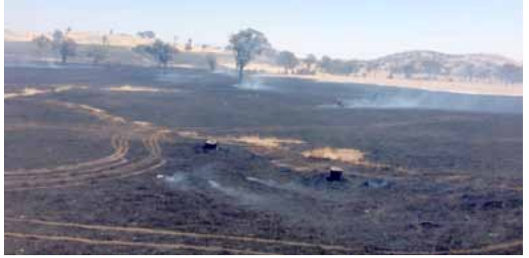
The results of a fast moving grass fire