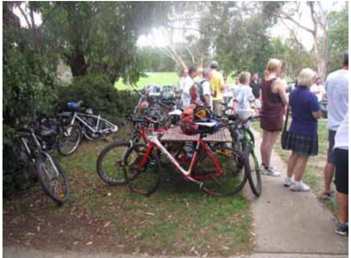
Canberra bike riders the Hash House Harriers ride to Hall. The new Centenary Trail is a magnet for Canberras push bike riders.