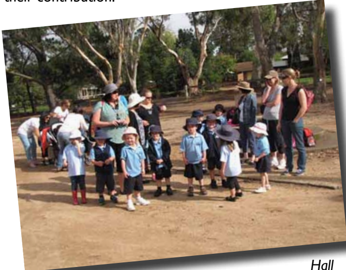
Hall preschoolers arrive at the National Sheepdog Trials