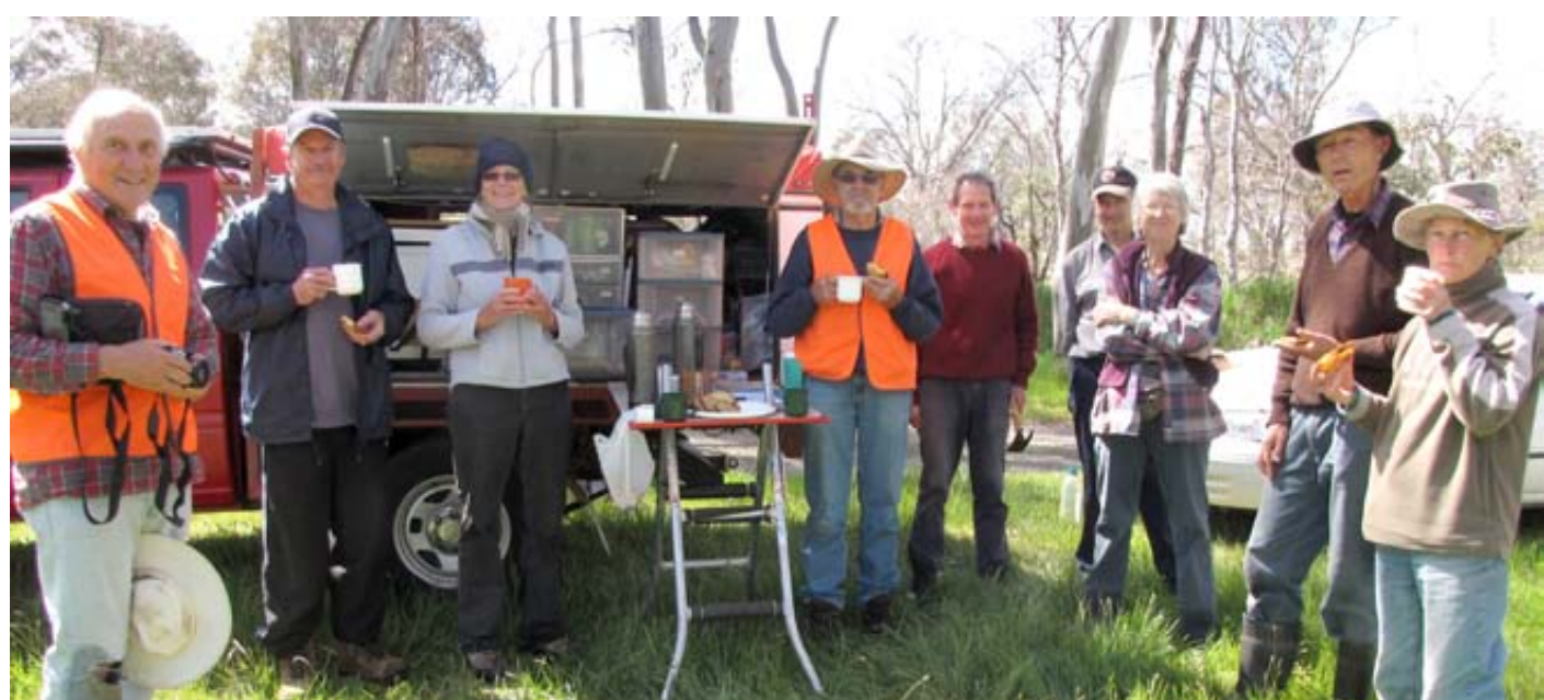
Land Care group, all volunteers, maintain and carry out weed control at Hall Cemetery in October.