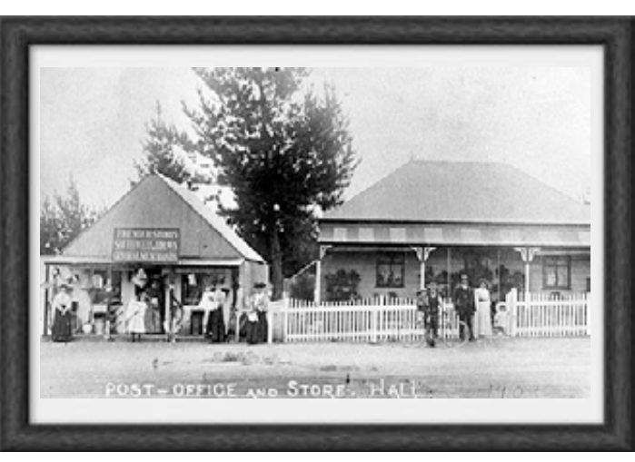
Hall Post Office and Store, 1910

Some residents may not be aware that our Hall Post Office was recently under threat of closure by Australia Post. Some alert Hall citizens picked up signals that Australia Post was being groomed for privatization along with a treasure trove of other publicly owned utilities. Profitable businesses in Australia Post were to be flogged off in preparation for a media campaign and sale.